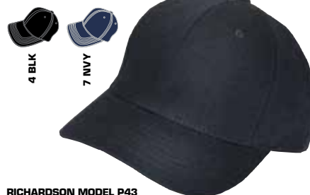
RICHARDSON MODEL P43